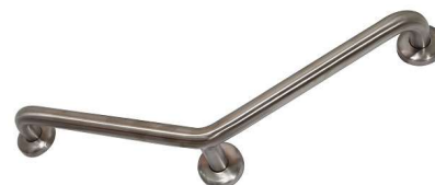
15.211.ST stain finish