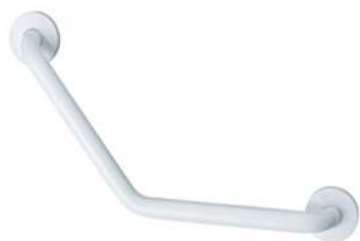
15.111.W, 15.114.W white epoxy