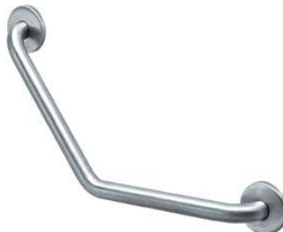
15.211.S, 15.212.S, 15.213.S stain finish