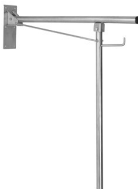
15.225.S satin finish